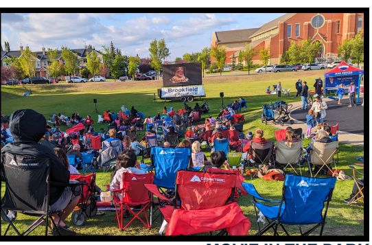
MOVIE IN THE PARK