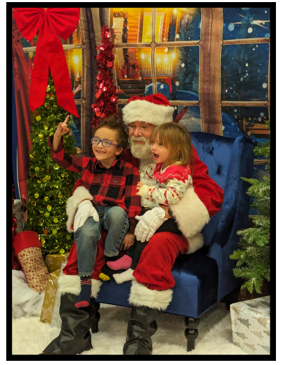
SANTA CLAUS IS COMING TO TOWNE